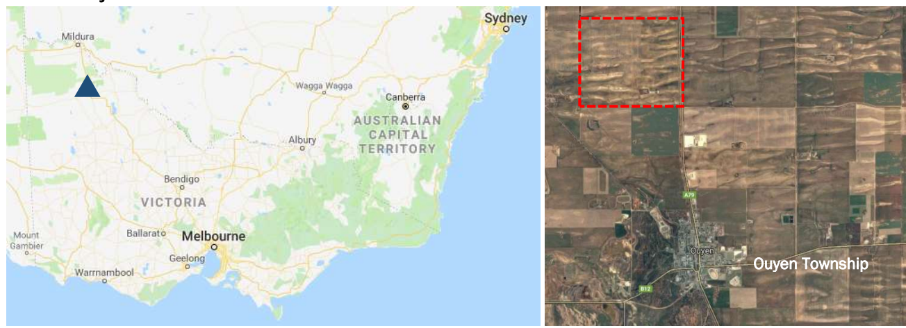
Figure 1: Location of Kiamal Solar Farm

Kiamal Solar Farm (KSF or the Project) has been developed by Kiamal Solar Farm Pty Ltd (a fully owned subsidiary of Total Eren S.A.) and is currently under construction. The Project will have a total nameplate capacity of 200 MWac / 256.48 MWp consisting of nearly 718,000 solar PV modules located across 500 ha of land. The Project is located 3 km north of the township of Ouyen and approximately 100 km south of Mildura in north-west Victoria.