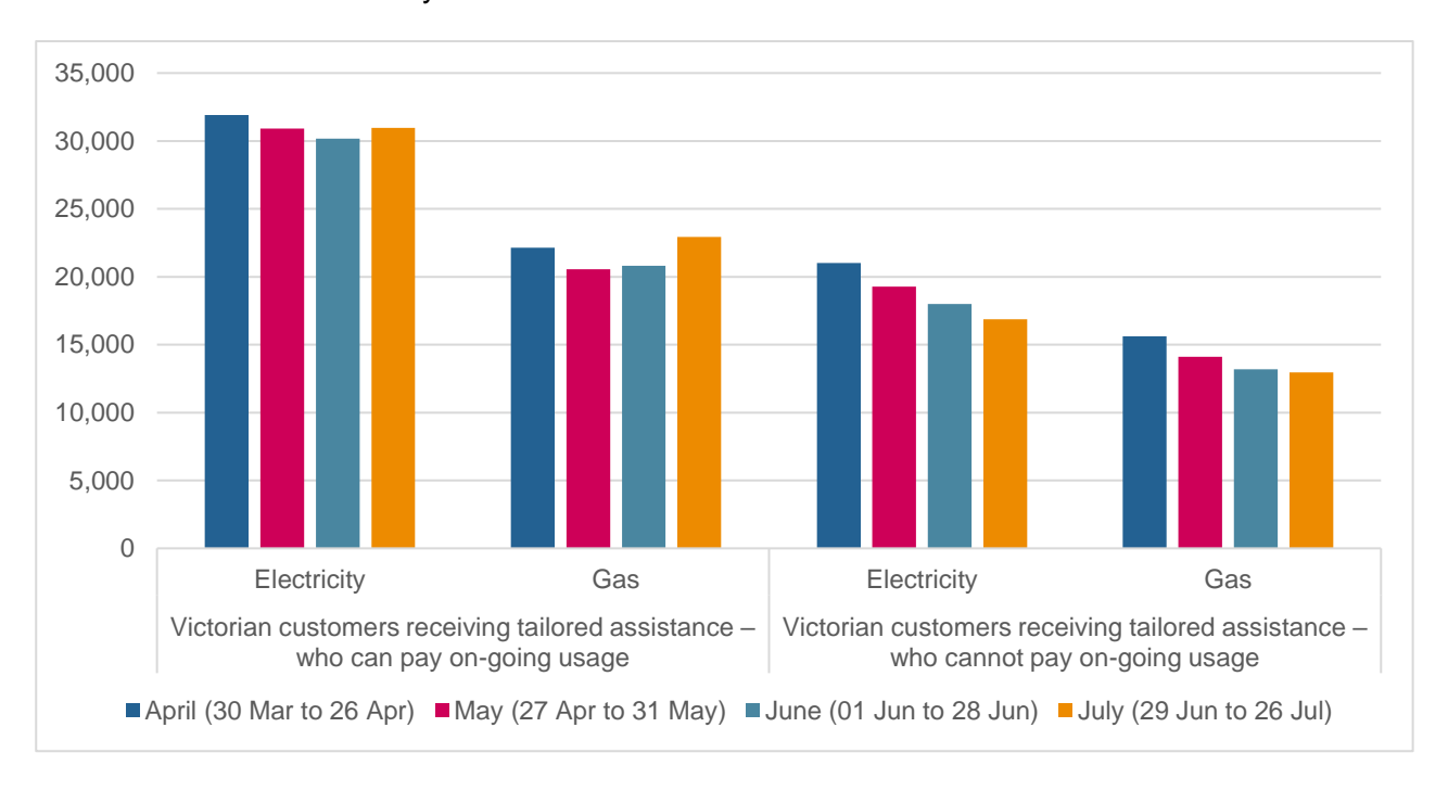
Figure 1 Number of Victorian residential customers receiving tailored assistance during the pandemic.

all Victorian electricity customers and 1.7 per cent of all gas customers were receiving tailored assistance at the end of July.